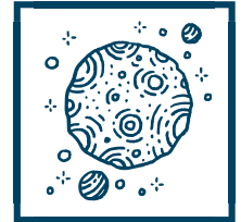
Something Out of This World