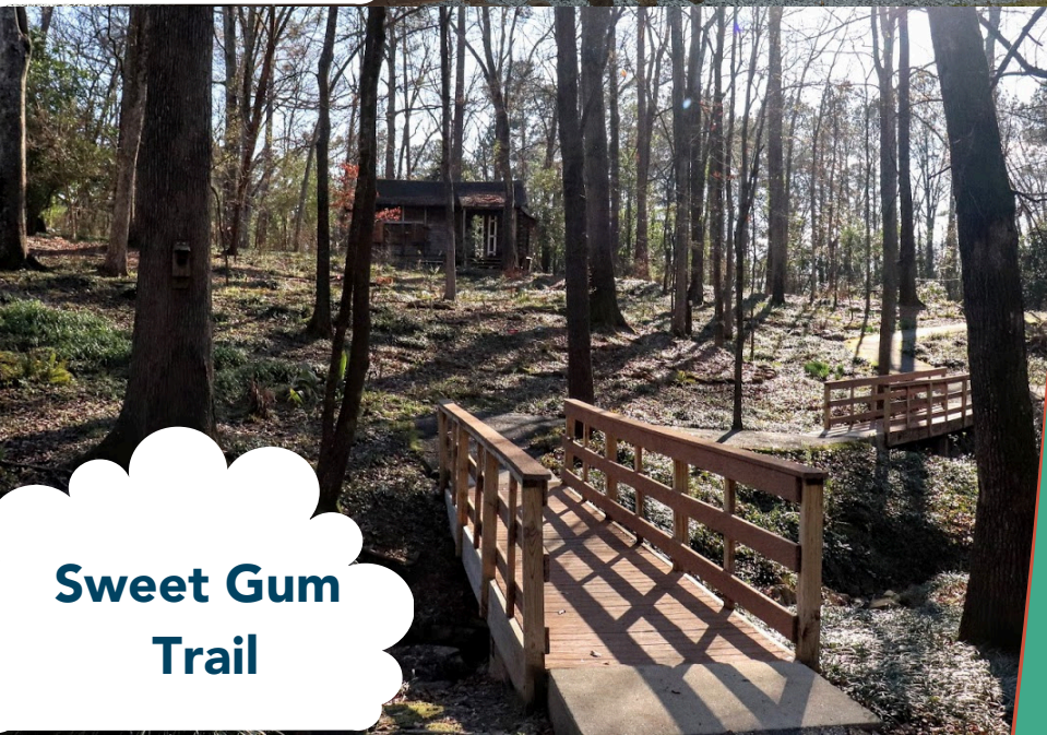
Sweet Gum Trail

While you are there, take a look at our Caboose , which has been with the Museum since 1964.