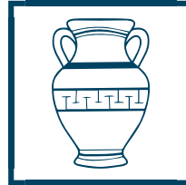
Something Made of Clay