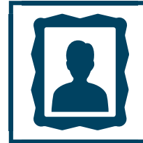
Something Staring Back at You